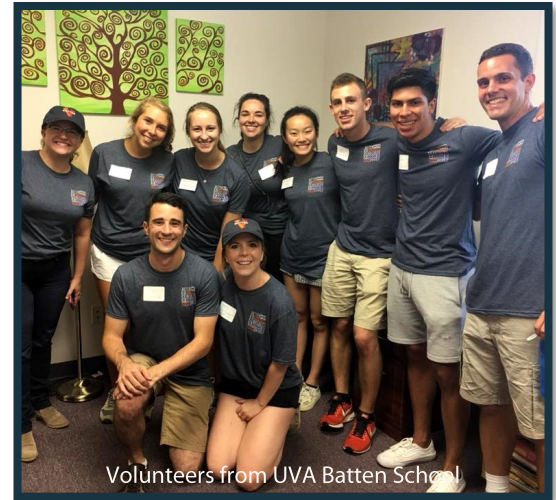
Volunteers from UVA Batten School

Thank you to our friends at Champion Brewing Co., Reason Beer, South Street Brewery, Three Notch'd Brewing Co., and to everyone who participated in Simcoe for SARA 2019!